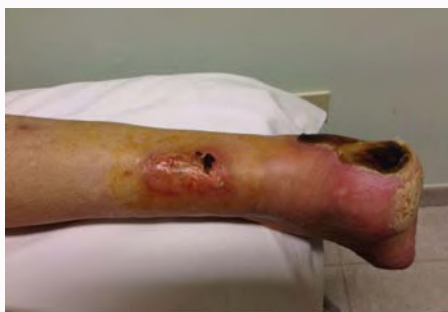
Figure 2: Necrotic lesions of right lower limb.