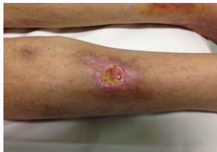
Figure 3: Initial healing of lesion of left leg after several specific medication: note absence of necrosis and appearance of granulation tissue (yellow layer).