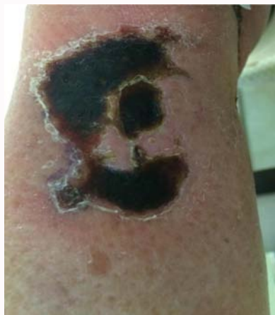
Figure 1: Necrotic lesions of left lower limb.