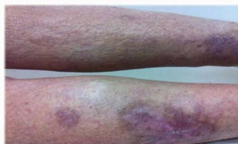
Figure 4: Complete healing of lesion; skin scars remain.

ulcers or gangrene, at times requiring amputation (Figure 1). The development of infections resulting in sepsis or death is a frequent occurrence.