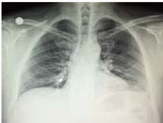
Figure 1: Posteroanterior chest radiograph showing radiopaque dental instrument located in the right lower lobe bronchus.