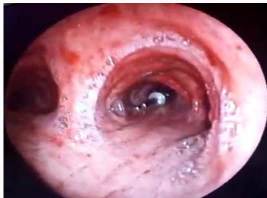
Figure 3: Location of the instrument visualized by fiberoptic bronchoscopy.