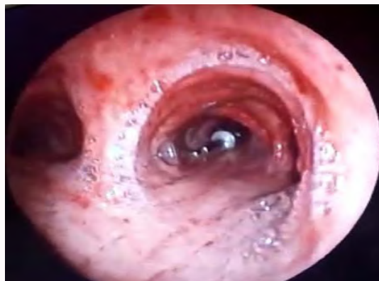
Figure 3: Location of the instrument visualized by fiberoptic bronchoscopy.