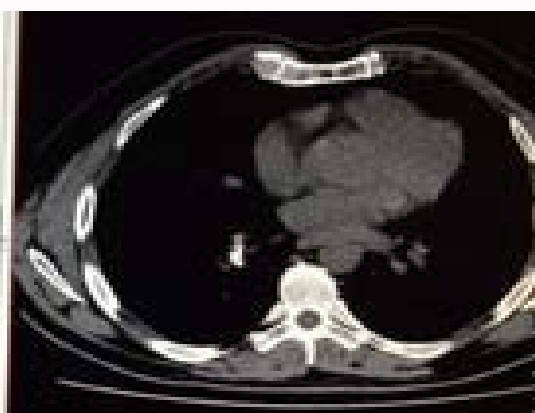
Figure 2: Thoracic computed tomography showing dental instrument located at the entrance of the right lower lobe bronchus.